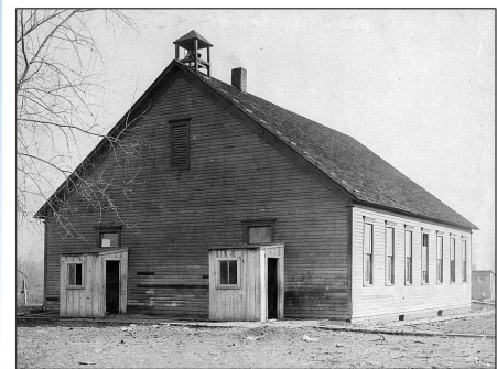
Harlem School

A treasure trove of information featuring more than 1,100 historic sites and points of interest throughout Clay County. Sites date back to the original formation of Clay County in the 1820s. Many have been lost with the passing of time. Handcrafted maps reflect the current or former location of the sites. Points of interest include businesses, homes, schools, churches, communities, roads, bridges, railroads, mills, springs, streams, rivers, landings, and more. Images, sourced from the Archives' photo collection, accompany brief descriptions of the sites. GPS coordinates are provided for many of the points of interest.