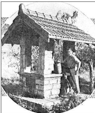
The Barry Well